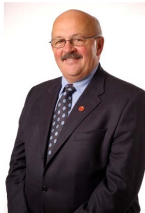
Sen. Terry M. Mercer, CFRE Vice Chair, Ext. Relations